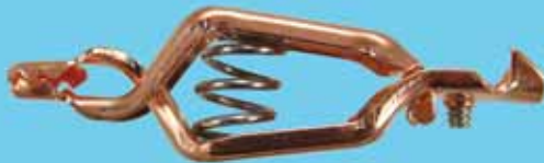
General Purpose Test Clip, Solid Copper, 40 Amp